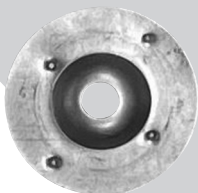
1 x Cap