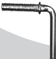
1 x Seven-character screw