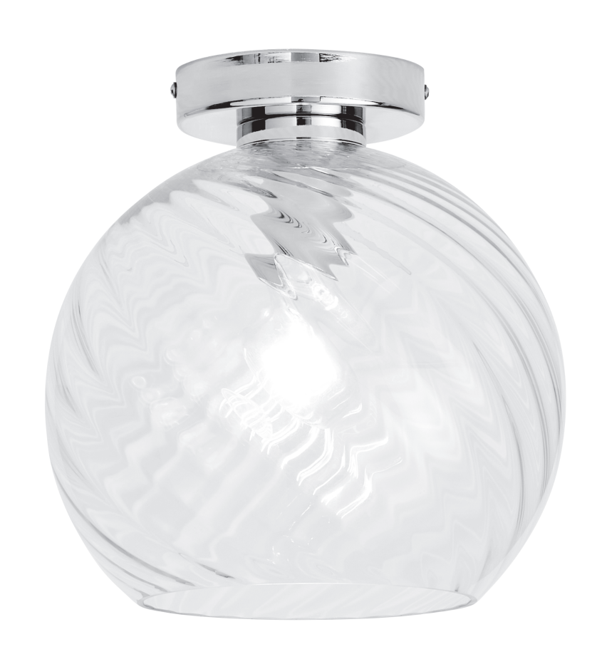
Diagram shown for illustration purposes only - product may differ slightly from the one shown above

Requires 1 x 10W max. LED E27 GLS bulb (bulb not included)