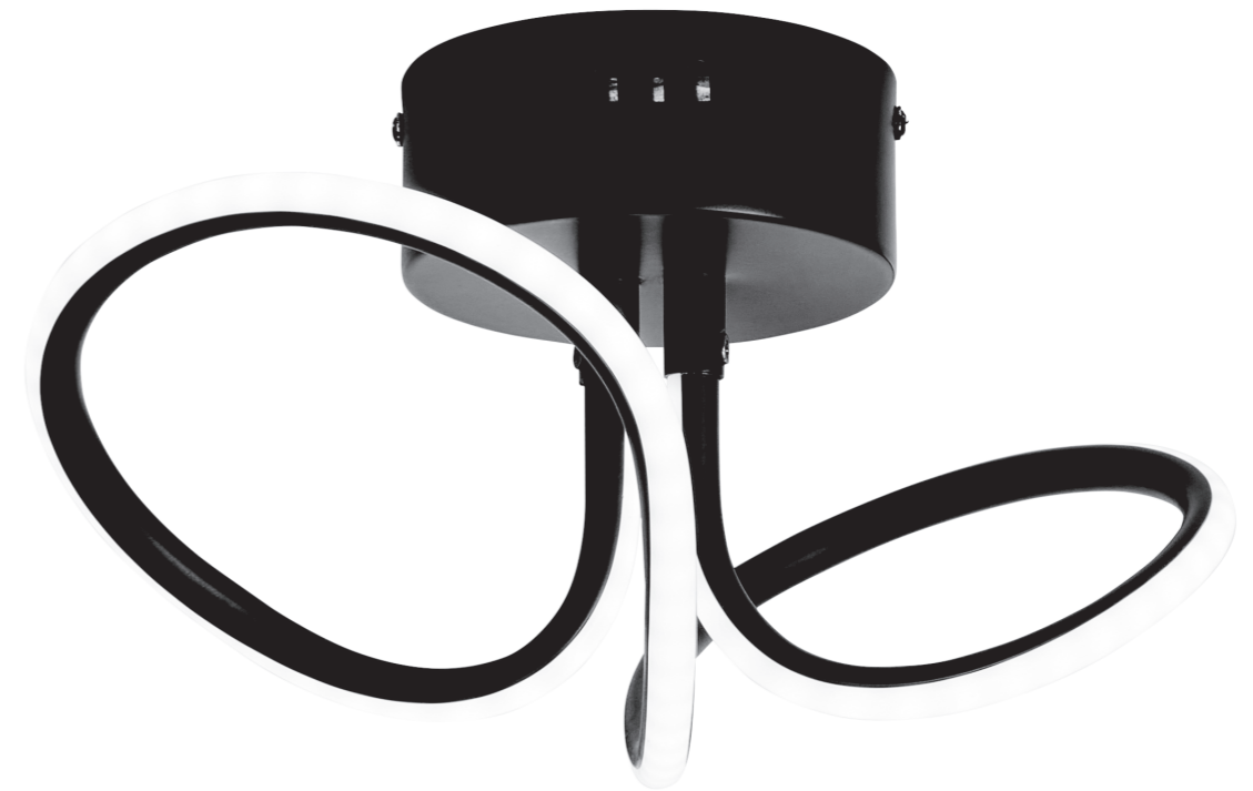
Diagram shown for illustration purposes only - product may differ slightly from the one shown above