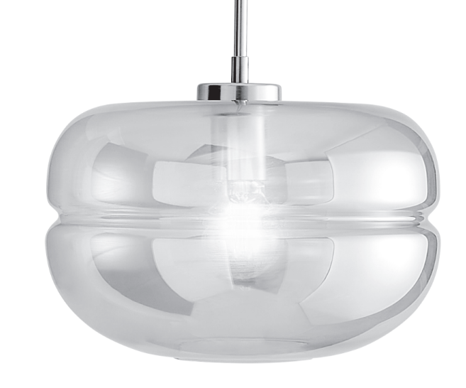
Diagram shown for illustration purposes only - product may differ slightly from the one shown above

Requires 1 x 10W max. LED E27 GLS bulb (bulb not included)