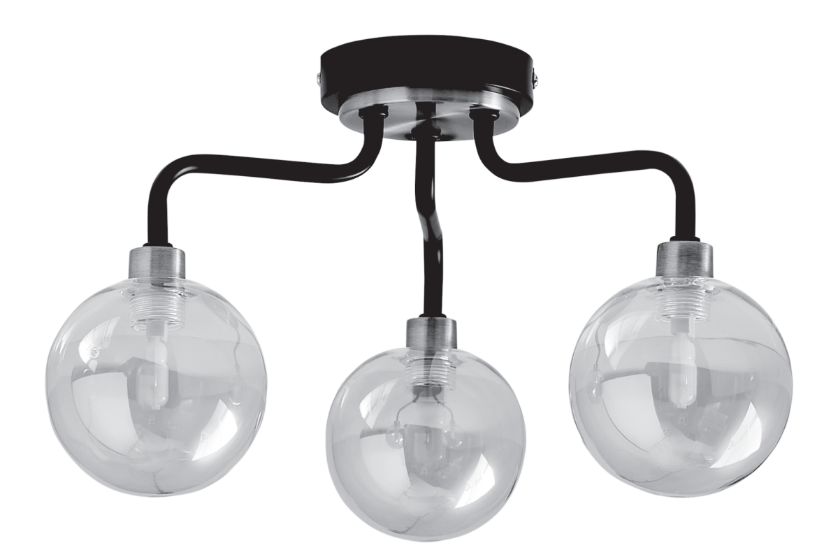
Diagram shown for illustration purposes only - product may differ slightly from the one shown above

Requires 3 x 3W max. LED G9 capsule bulbs (bulbs not included)