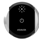
Shower warming up

To switch on your shower, press the button on the remote control. The white LED light will light up and start to flash. It will continue to flash until the water has reached temperature. Once the water has reached temperature, the white LED light will stop flashing and remain on for a further 5 seconds. Sudden temperature change or disruption of signal can affect this function and LED status.