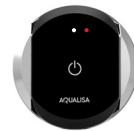
Out of range

Your remote will display white and red LED lights to indicate a weak signal, when the button is pressed.